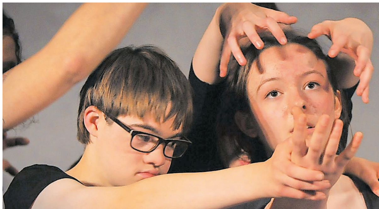
■ Total Ensemble performing at the Norfolk Arts Awards.

She said: "The whole show is an introspective look. I talked to all the